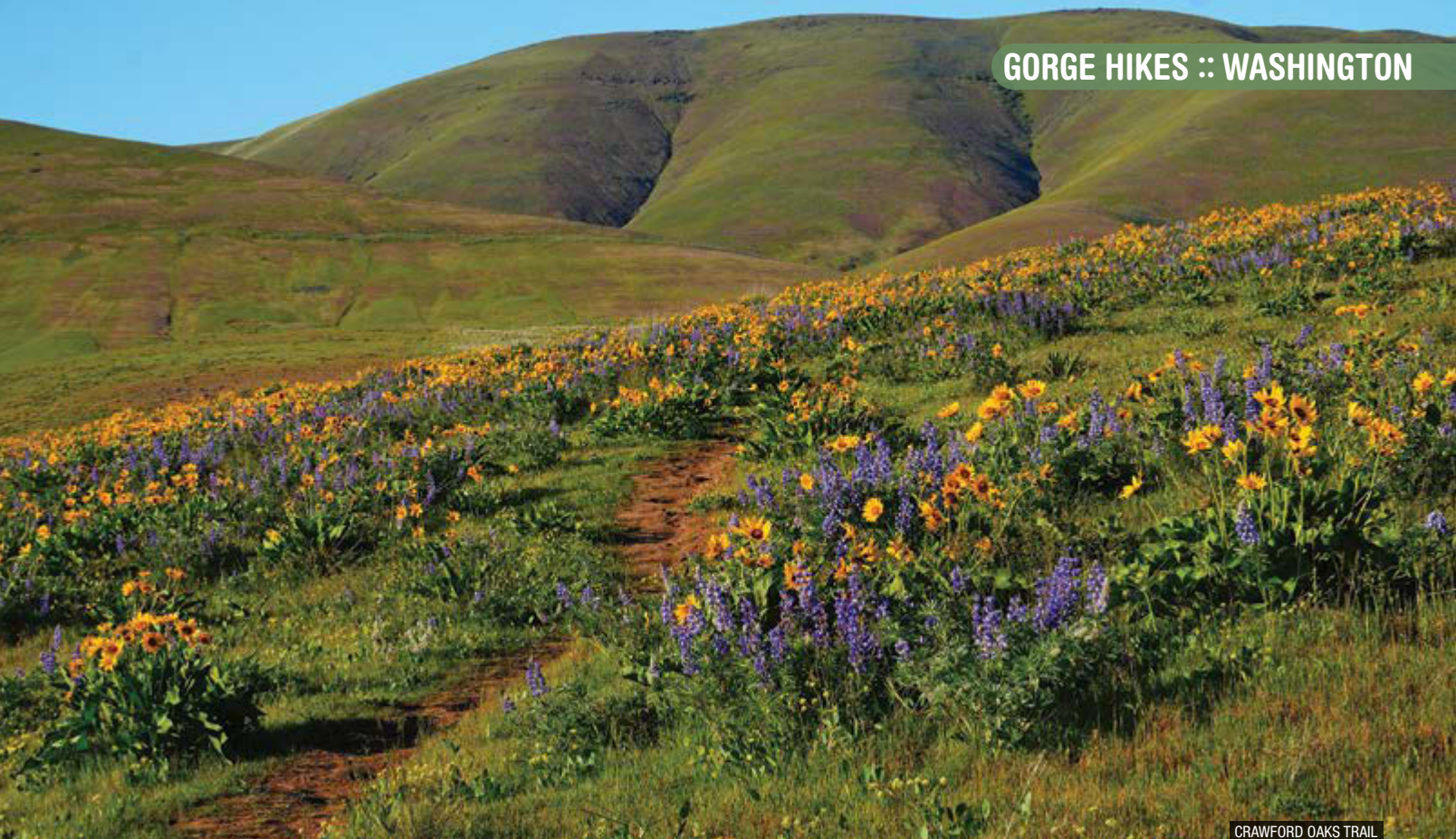
CRAWFORD OAKS TRAIL