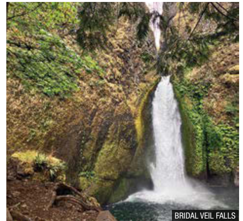
BRIDAL VEIL FALLS