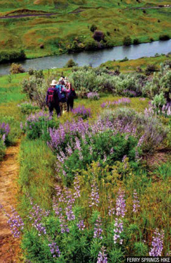
FERRY SPRINGS HIKE